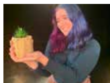
Year 10 Drama Students