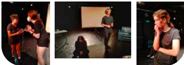
Year 11 Drama students