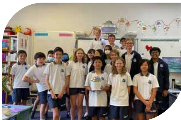
Ms Feros Languages

Thanks everyone for a fun week of language learning. The bar has been raised high for 2023.