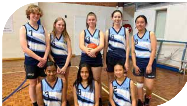
Open Girls Basketball

In the past few weeks our Open Girls Touch and Open Boys Volleyball progressed to the next round of competition, whilst Open Girls and Boys Basketball teams were both eliminated. Our tennis, netball, football, and cricket teams are all due to play once the weather improves.