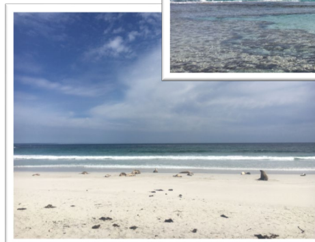
Seals on the beach