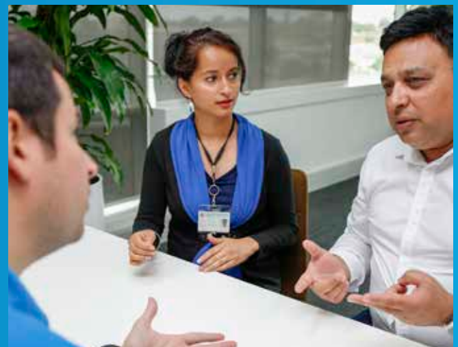
Interpreters fulfill an important role in their communities.

For more information email scholarships@multicultural.nsw.gov.au .