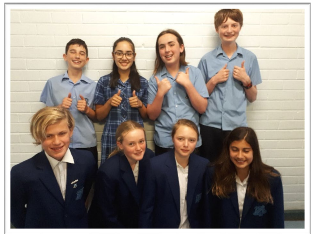
Pictured: Manly Campus and St Ives High junior debaters