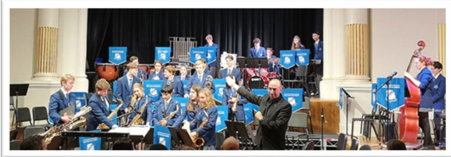
Symphonic Wind Orchestra

Last Sunday night, our senior wind and jazz bands as well as our strings groups wowed the audience with their musical talent at our band program's premier event where our departing Year 12 students were able to showcase their wonderful musicianship and gave the audience an opportunity to farewell them in style. There were plenty of smiles mixed with a few tears and was a fabulous opportunity to celebrate the high standard of music at our school.