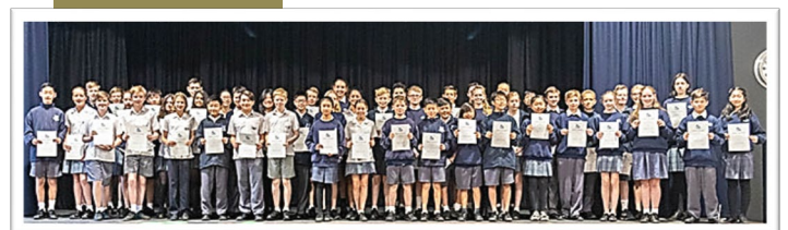
Year 7 Principal's Award recipients