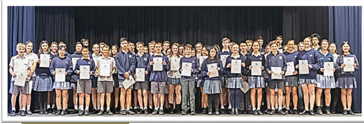
Year 9 Principal's Award recipients