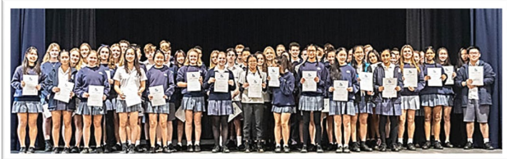
Year 10 Principal's Award recipients