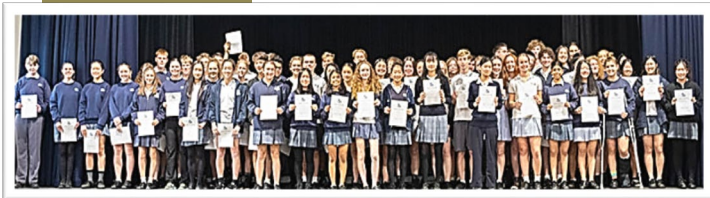
Year 11 Principal's Award recipients