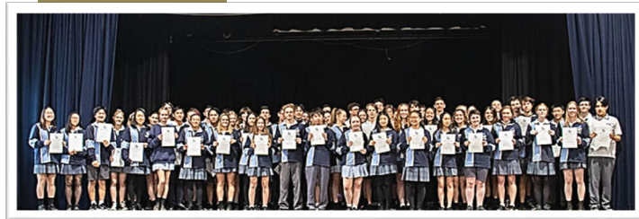
Year 12 Principal's Award recipients