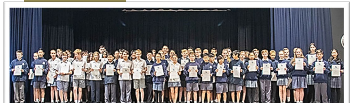
Year 8 Principal's Award recipients