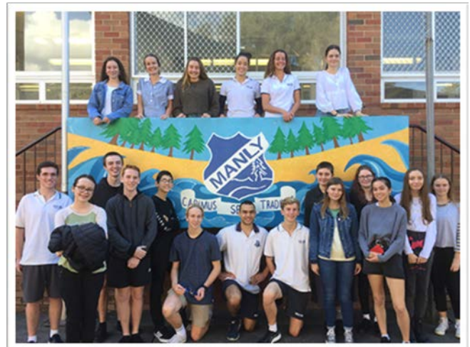
Students from Lismore school visiting Manly Campus

'The school had a great vibe to it and the students made us feel welcome'