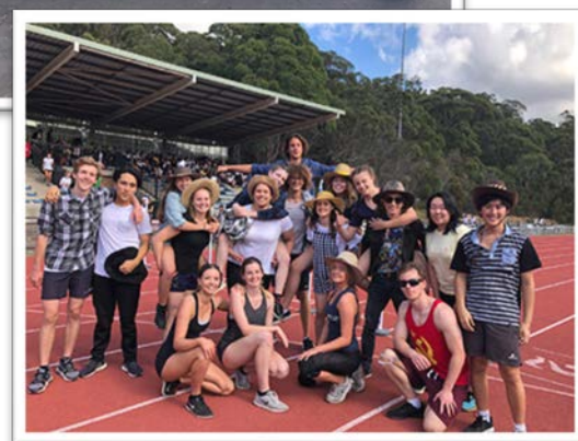
Year 12 Farm House