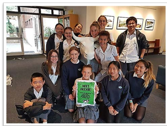
The excited Archibull team unwrapping the cow