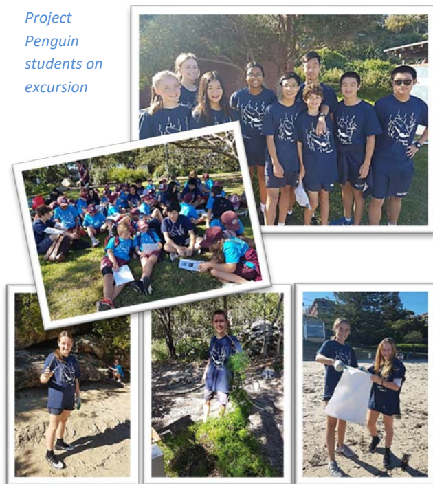
Project Penguin students on excursion

Our students were fantastic mentors to their primary groups and thoroughly enjoyed the opportunity to give back to the community and develop their leadership skills. Project Penguin continues later this month when our mentors will visit Harbord Primary School.