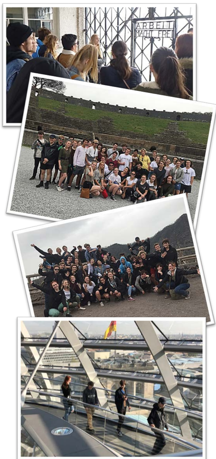
From the top: At the gates of the Dachau prison camp, group photo in Pompeii Amphitheatre, group photo on top of Mt Vesuvius, inside Reichstag dome in Berlin