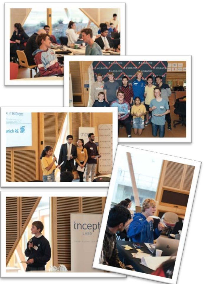
Photos from the Business Innovation Challenge