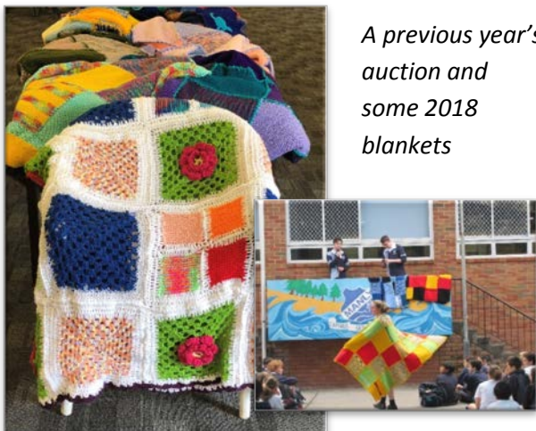
A previous year's auction and some 2018 blankets