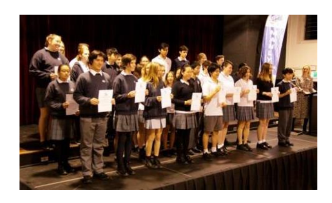
Year 11 Principal's Award winners