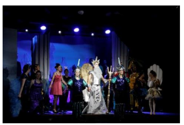
Scene from 'The Little Mermaid'