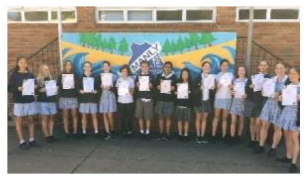
Year 8 Principal's Award winners

As we come to the end of the 3<sup>rd</sup> quarter, Year 8 seems to be stepping up and taking on even more challenges. This term has been action packed and the cohort has once again impressed me with their dedication and application to our whole school community.