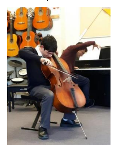
Elden Loomes, cello virtuoso