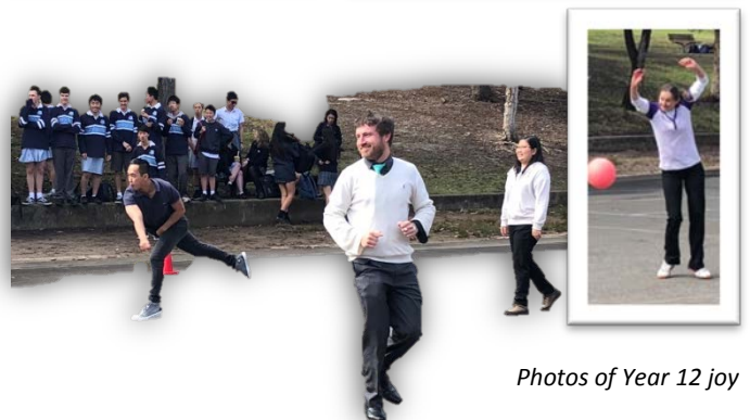
Photos of Year 12 joy