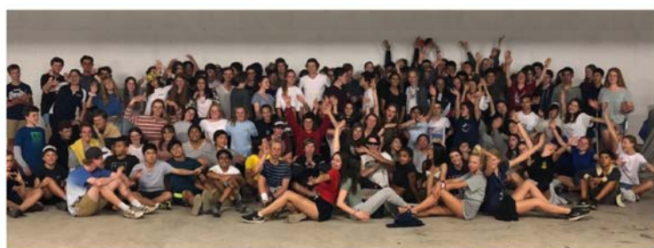
Year 9 Cohort at Camp