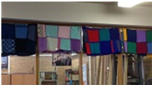
2017 Blankets hanging in the Library

The Library staff would like to say a big thank you to everyone who has been involved especially the volunteers that have sewn up blankets