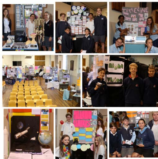
Science Techno Winning Exhibits