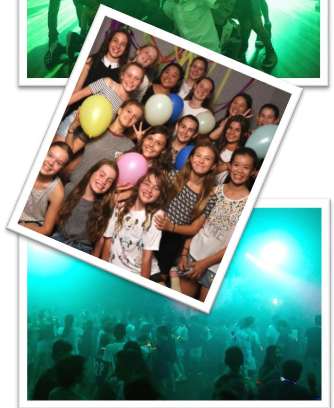
Yr 7 Disco