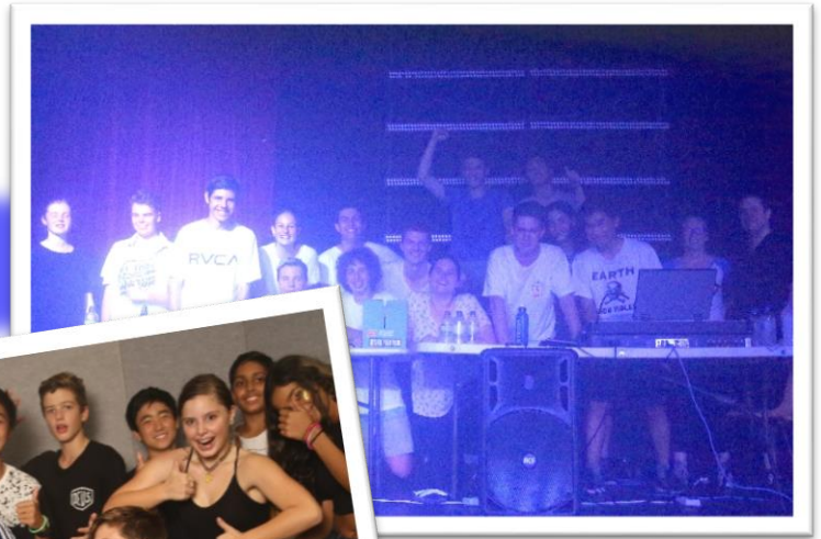
Yr 8 and 9 Disco