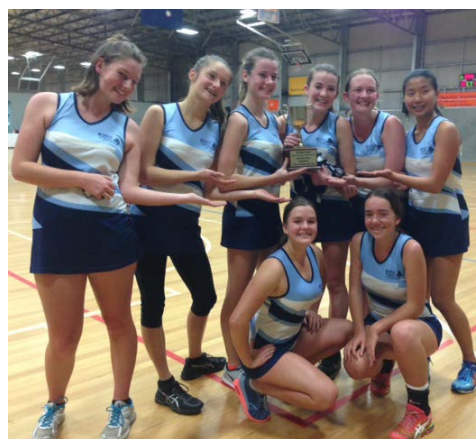
Senior Girls Netball winners