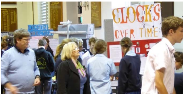
Science Techno Museum