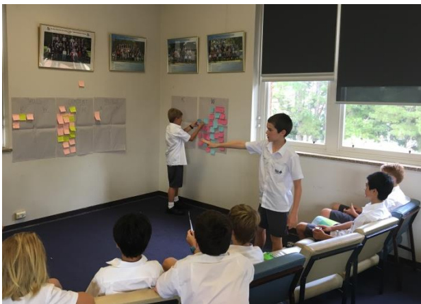
Year 7 students participating in Gifted and Talented Project Based Learning