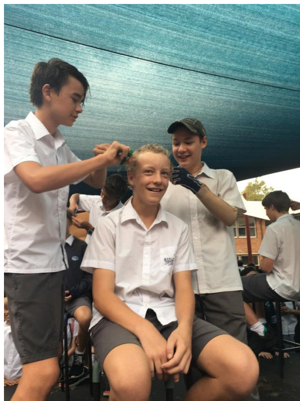
Students participate in Shave for a Cure