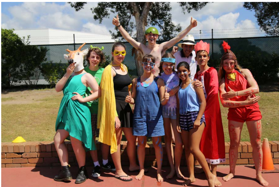
House Spirit at the Swimming Carnival