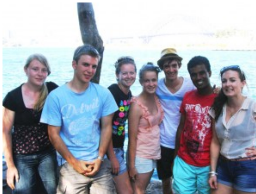
National Finalists – Echuca Convention

Proudly sponsored by National Australia Bank