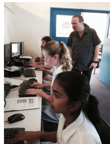
Year 7 students participating in the Unity Workshop.