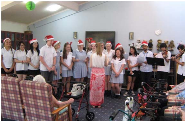
War Vets Performance