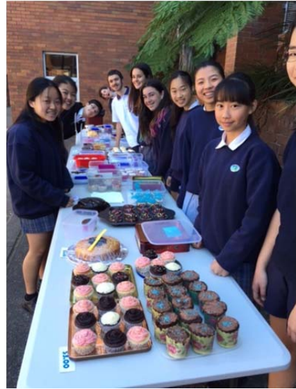
Fundraising for Spain