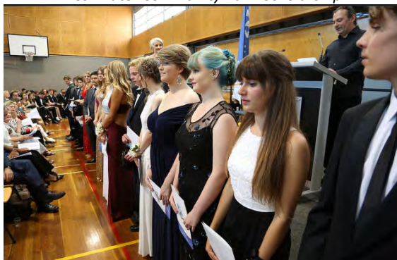
Year 12 Graduates